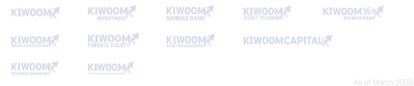
As of March 2026